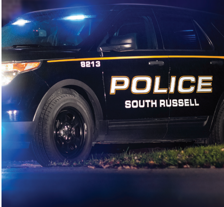
V4000 Reflective Films