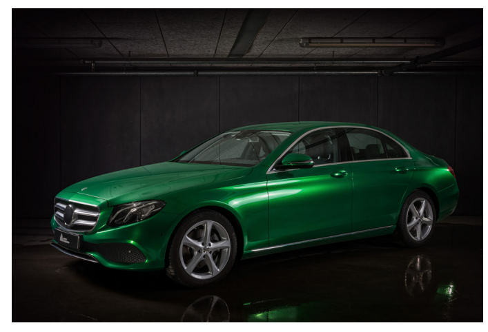
Gloss Metallic - Radioactive