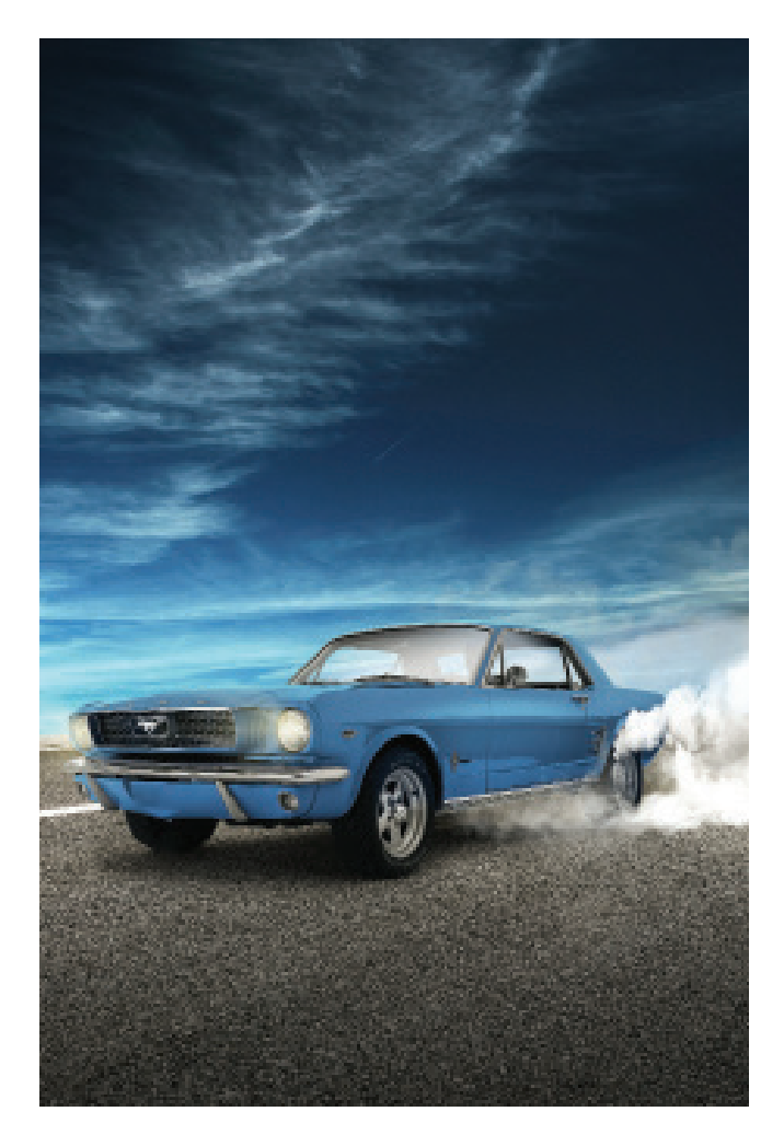
Gloss Pastel - Smokey Blue